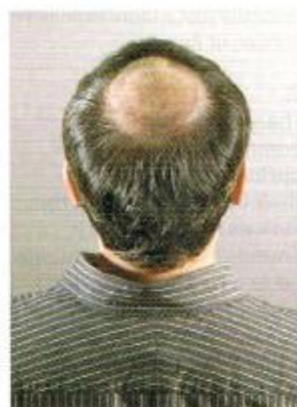
The pre-rug spot.

Here's the point and the problem: Life with a hairpiece, especially one this undetectable, isn't simply glue-and-go. This is a high-maintenance lie. Some wearers get a new piece every two weeks. Some visit the Hair Club for styling and regluing