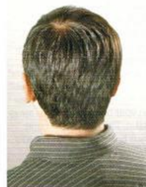
Bald no more! (Sort of.)