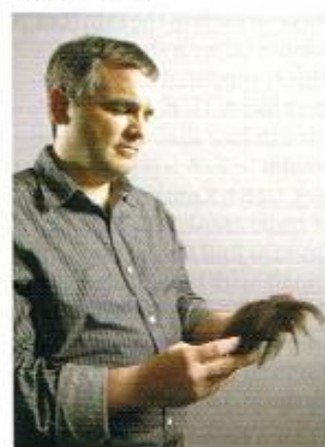
The author and his new friend.